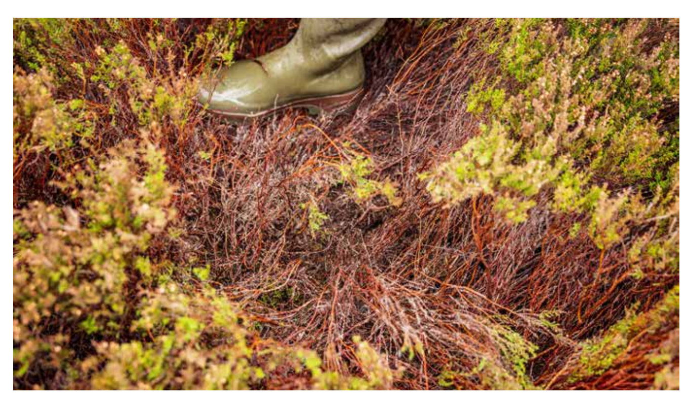
Above: Where heather has been denied cutting and burning applications, the moss layer has all but disappeared due to heather growth way beyond optimal height. Right: A naturally formed sphagnum hummock that is over hundreds of years old, which survived despite Jim and previous keepers cool burning the heather over the top of it for decades. This quashes claims that burning damages the peat and vegetation layer below.

"Of additional concern is where we have seen restoration works carried out on Woodhead, rosebay willowherb is rife – an invasive weed that will grow anywhere. It is hard to tell if this has been imported via the heather brash that has been used previously or if it is in the grass seed mixes used to revegetate bare peat. On other SSSI moors with lots of restoration work being carried out – Marsden for example – a lot of this weed can now be found."